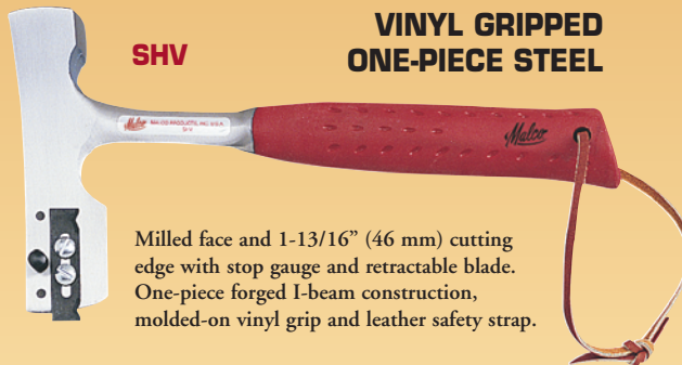
SHV VINYL GRIPPED ONE-PIECE STEEL

Milled face and 1-13/16" (46 mm) cutting edge with stop gauge and retractable blade. One-piece forged I-beam construction, molded-on vinyl grip and leather safety strap.