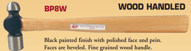
BP8W WOOD HANDLED

Black painted finish with polished face and pein. Faces are beveled. Fine grained wood handle.