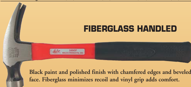
16SCF FIBERGLASS HANDLED

Black paint and polished finish with chamfered edges and beveled face. Fiberglass minimizes recoil and vinyl grip adds comfort.