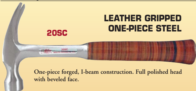
20SC LEATHER GRIPPED ONE-PIECE STEEL

One-piece forged, I-beam construction. Full polished head with beveled face.