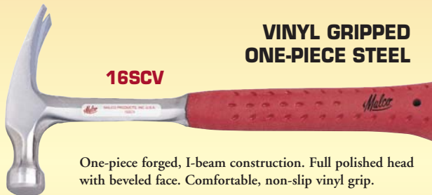
16SCV VINYL GRIPPED ONE-PIECE STEEL

One-piece forged, I-beam construction. Full polished head with beveled face. Comfortable, non-slip vinyl grip.