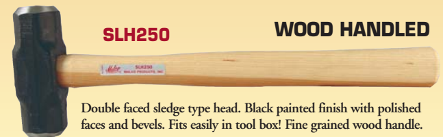
SLH250 WOOD HANDLED

Double faced sledge type head. Black painted finish with polished faces and bevels. Fits easily in tool box! Fine grained wood handle.