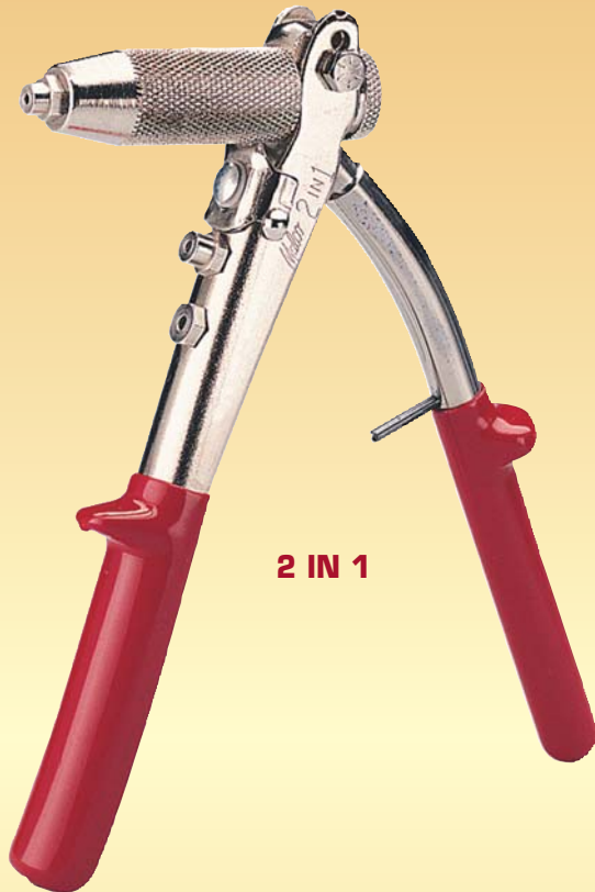
2 IN 1