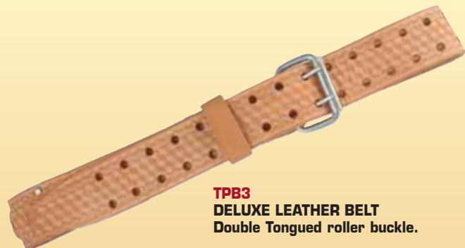
TPB3 DELUXE LEATHER BELT Double Tongued roller buckle.

WEB BELT: 2-1/4" (57 mm) wide heavy webbing. U.S. Army spec. hardware. Adjustable up to 46" (1168 mm) waist.