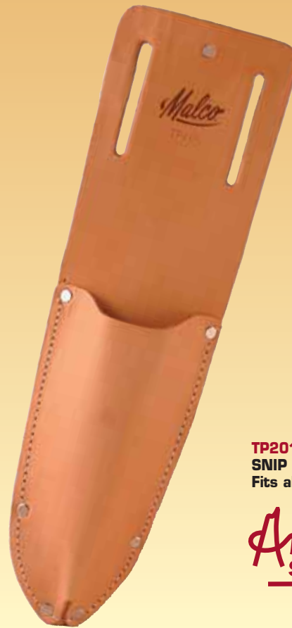
TP201 SNIP HOLSTER Fits all Andy™ snips