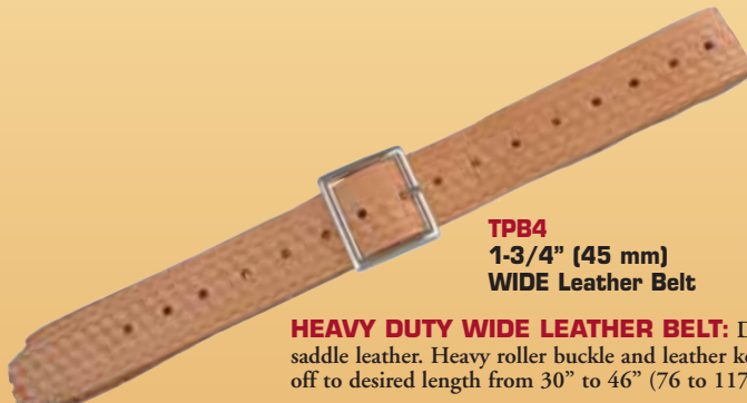
TPB4 1-3/4" (45 mm) WIDE Leather Belt

DELUXE LEATHER BELT: Distinctive 2" (51 mm) wide saddle leather belt. Double tongue roller buckle. One size fits all, cut off to desired length from 30" to 46" (76 to 117 cm).