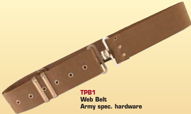
TPB1 Web Belt Army spec. hardware

WEB BELT: 2-1/4" (57 mm) wide heavy webbing. U.S. Army spec. hardware. Adjustable up to 46" (1168 mm) waist.