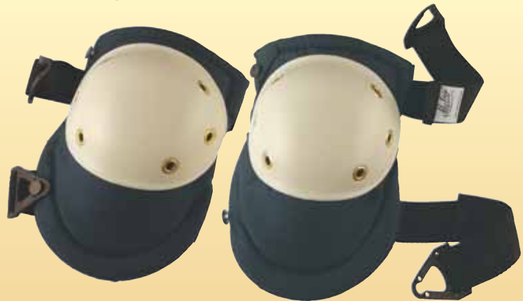
TPKP2 HARDCAP CONTOURED KNEE PADS

Catalog Number Description / Nominal Dimensions