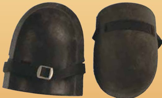
TPKP8 FOAM RUBBER KNEE PADS

Catalog Number Description / Nominal Dimensions