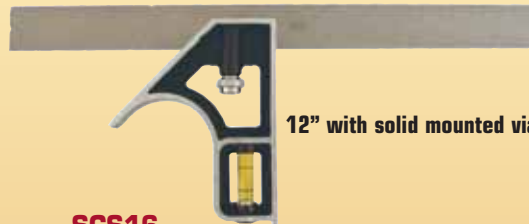
12" with solid mounted vial