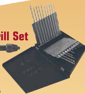
FJ6180 includes PV1 Pin Vise