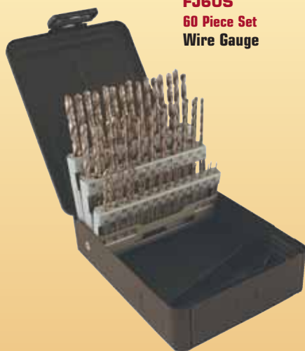
FJ60S 60 Piece Set Wire Gauge