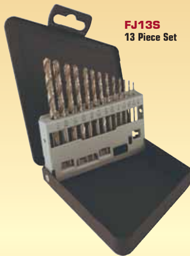
FJ13S 13 Piece Set